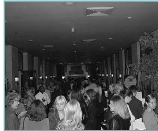
Industry Partner Tabletops Galore!